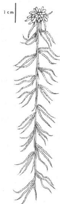
northern peat moss ( Sphagnum capillifolium )