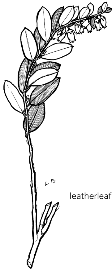
leatherleaf ( Chamaedaphne calyculata )