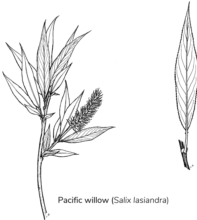
Pacific willow ( Salix lasiandra )