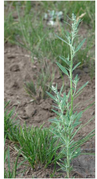
Narrowleaf Goosefoot *see Distinguishing features