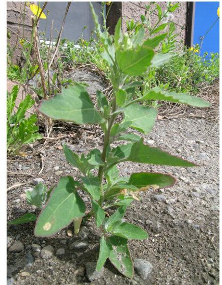
Lamb's Quarter ( Chenopodium album ) *see distinguishing features