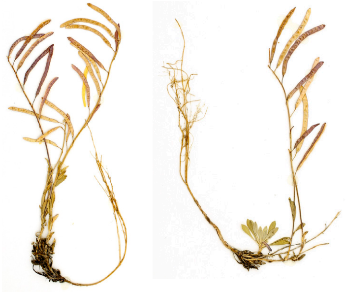
Agri-food and Agriculture Canada (DAO)

Boechea drepanoloba is easily distinguished from B. stricta by its fruits spreading from one side of the stem and more highly branched (3- to 6-rayed vs. strictly 2-rayed) hairs on the basal leaves.