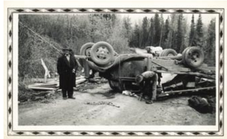
An accident on the Alaska Highway, 1943.