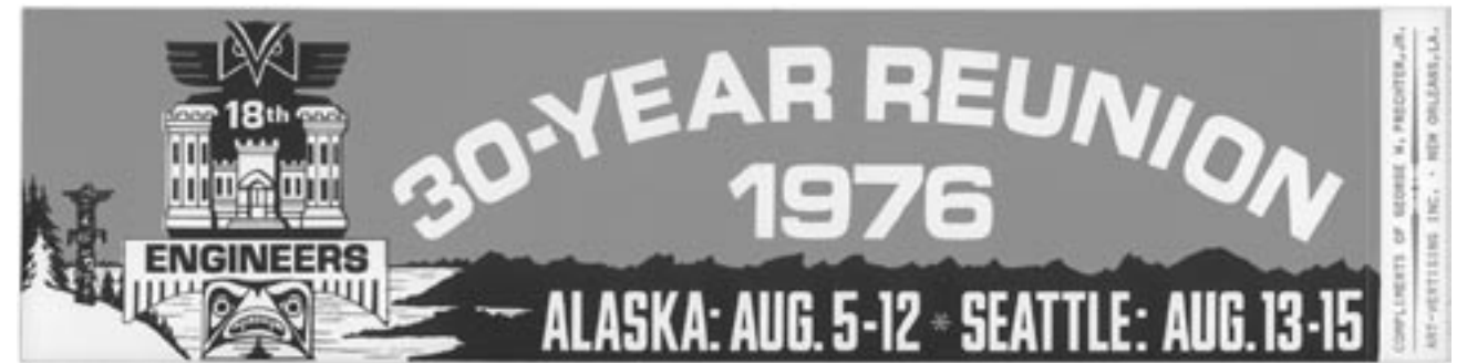
18th Engineers' 30-Year Reunion bumper sticker, 1976. Yukon Archives. U.S. Corps of Engineers, 82/250, COR 001.