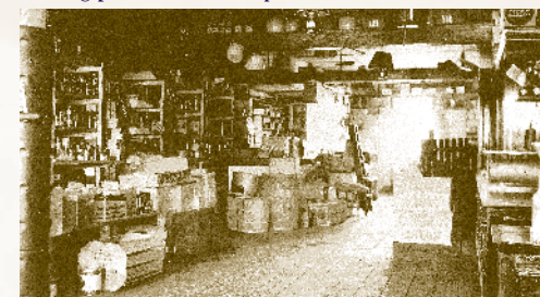
The interior of the Schofield and Zimmerlee store.

The Chilkats, a Tlingit tribe from the coast, were trading partners and frequent visitors to Fort Selkirk.