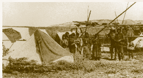
Group of Pelly Indians at Fort Selkirk, 1894. from: Glimpses of Alaska, Klondike & Goldfields by V. Wilson, 1895.

Northern Tutchone people of the lower Pelly region stopped here during their seasonal round. Following