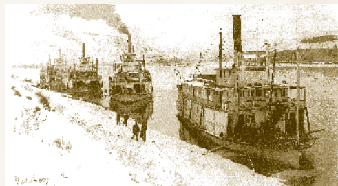
Sternwheelers Tyrrell, Dawson, Selkirk & Whitehorse docked at Fort Selkirk, 1903.