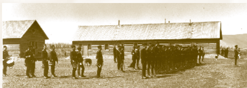
Yukon Field Force at Fort Selkirk in 1898. Buildings in background are L-R: Dining Mess, Sergeant's Mess & Quarter Master Stores.

parade square. The Canadian government sent the Force north to keep order during the Klondike Gold Rush and ensure that the large number of Americans flocking to the gold fields did not threaten Canadian control of the area. The Force did not stay long; during the spring following their arrival at Fort Selkirk, 200 soldiers were dispersed to Dawson City or sent south.