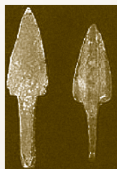
Native copper arrow points

People have lived here a long time. Selkirk First Nation Elders tell stories of a volcanic eruption that occurred nearby an estimated 7,000 years ago. Stone tools discovered near Fort Selkirk have been dated at 8,000 to 10,000 years old. The discovery of 1.3 million-year-old caribou bones across the river indicates that a food supply adequate for supporting human life existed long before people inhabited the region. Oral traditions and artifacts found near Fort Selkirk give us information about people who occupied the land long ago.