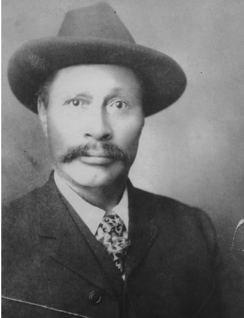
Yukon Archives, Whitehorse Star Ltd. fonds, 82/563, f85 #46

A Selective Bibliography of Archival and Library Material