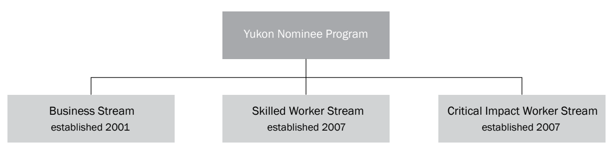
Figure 1. Yukon Nominee Program

The Skilled Worker Stream is administered by the Department of Education. As of January 2010, 124 applications to the Skilled Worker Stream were received, 102 of which were approved. Applications to the Yukon Nominee Program's Skilled Worker Stream increased approximately 23% from 2008 to 2009, despite the economic downturn. This increase is largely due to sector-specific shortages that represent jobs in early childhood education, culinary arts, computer programming, interactive media development, as well as supervisory positions in retail, food service and cleaning.