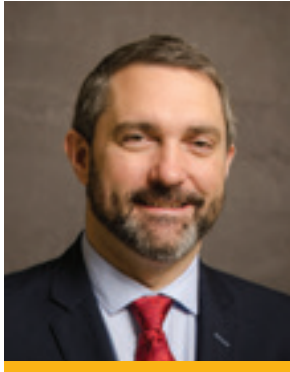
Premier Sandy Silver