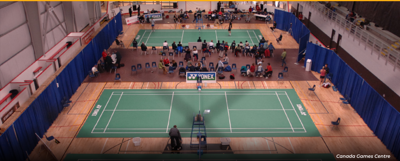
Canada Games Centre