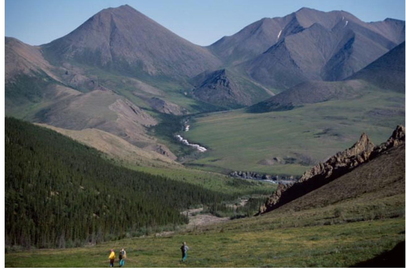
Figure 165-1. View looking eastward in the Richardson Mountains showing spruce forest growing on lower elevation, south-facing slopes. Other slope aspects and elevations above 600 m asl support only shrub and/or tundra vegetation.

DISTINGUISHING CHARACTERISTICS: The ecoregion contains the largest extent of unglaciated mountain ranges in Canada. Some excellent examples of periglacial landforms are found within the ecoregion, including solifluction lobes and cryoplanation summits and terraces. The northernmost Richardson Mountains host phosphate minerals, including lazulite, the Yukon gemstone. Vegetation cover, strongly influenced by aspect and elevation (Fig. 165-1), produces a surprising diversity of ecosystems and habitats. This mountainous ecoregion contains the Yukon portion of calving habitat along with important migration routes of the Porcupine caribou herd.