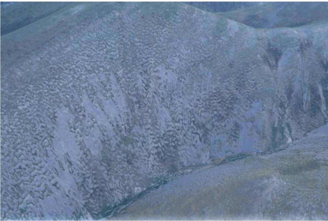
Figure 165-4. The mottled texture of this slope results from solifluction, the sliding of the active layer over the underlying permafrost. The solifluction lobes, like rolls, are several metres across and up to 2 m high. They are composed of a mix of mineral soil, organic matter and rock fragments.

During its maximum extent, the Laurentide Ice Sheet extended up to 970 m asl in the southern Richardson Mountains, descending to 880 m asl in McDougall Pass. This Late Wisconsinan limit 30,000 years ago (Hughes et al., 1981; Schweger and Matthews, 1991) is the only glacial limit represented in this ecoregion. Though the ice sheet crossed the continental divide in this ecoregion only at McDougall Pass, meltwater drained to the western side of the mountains at several sites, including the headwaters of the Road and Vittrekwa rivers. This resulted in several changes to pre-existing drainages, most importantly the westward diversion of the Porcupine River (Duk-Rodkin and Hughes, 1994) that caused the inundation of the Bell–Old Crow-Bluefish basins. The outlet of this proglacial lake cut a canyon to the west, establishing the Porcupine River as a tributary to the Yukon River. Today, the former thalweg of the paleo-Porcupine River in McDougall Pass is buried under 150 m of glacial drift. Terraces related to the preglacial drainage are found along both sides of the valley in McDougall Pass, some of which have been partially glaciated by the Laurentide Ice Sheet (Duk-Rodkin and Hughes, 1992a, 1994). The paleo-Porcupine River was one of the many drainage systems that