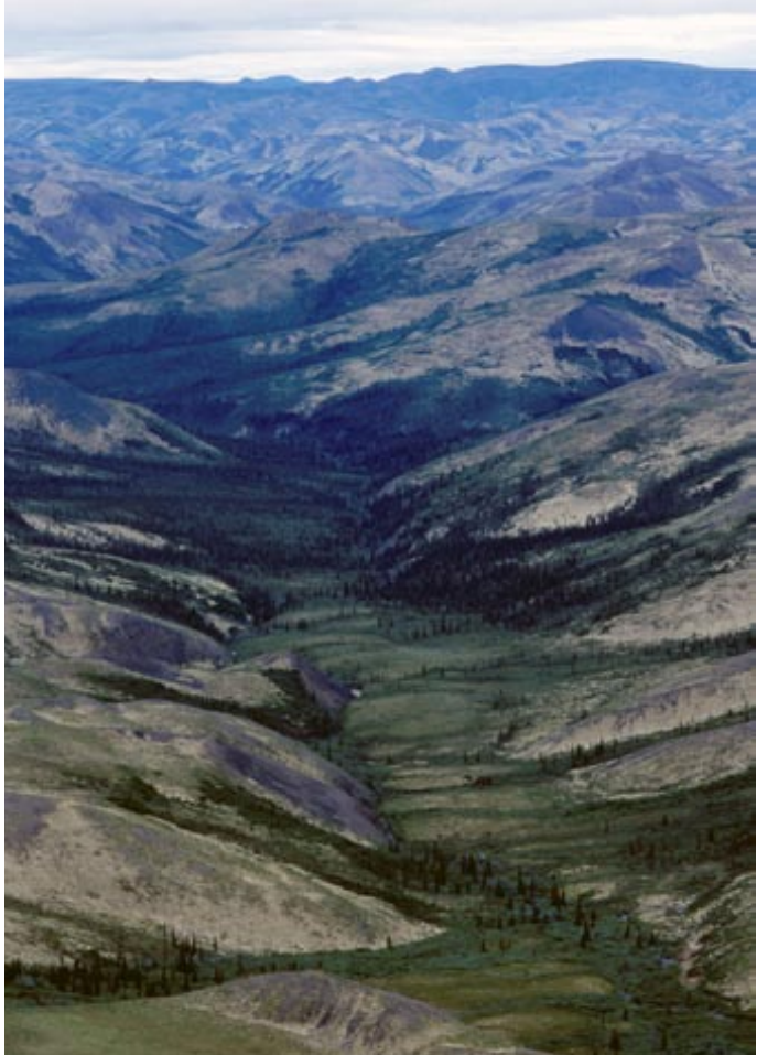
Figure 165-2. A view of the Richardson Mountains showing Laurentide glacial drift in valley bottoms and unglaciated upper slopes and ridgetops. Note the contrast between light coloured, lichen-dominated colluvial slopes and valley-bottom drift surfaces that are vegetated by darker coloured sedge tussock/moss communities.

This ecoregion contains well-exposed sedimentary rocks of Proterozoic to Cretaceous age and small Devonian granite intrusions, and spans three separate geological structures. The British and Barn mountains, an eastern continuation of the Alaskan Brooks Range, are part of the Arctic–Alaska Terrane, consisting of continental margin sediments (Wheeler and McFeely, 1991). The topographically subdued region east of the mountains is the Blow