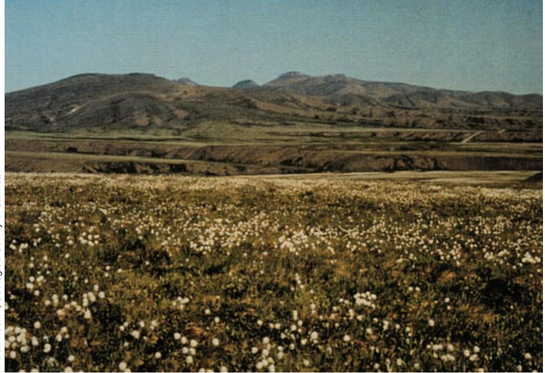
Figure 165-3. Pediment terraces on the eastern slope of the Richardson Mountains have been partly glaciated by the Laurentide ice sheet. The tundra vegetation in the foreground is dominated by cotton grass (Eriophorum vaginatum) .

Localized alpine glaciers affected the highest mountains during Pleistocene glacial periods of undetermined ages. There are two restricted areas where local glaciers developed: at the headwater of Malcolm River in the British Mountains (Duk-Rodkin, in press) and east of Bell River in an unnamed peak in the Richardson Mountains (Duk-Rodkin and Hughes, 1992a). Cirque scars are found in both these areas, but no glacial deposits have been recognized in the valleys of the Richardson Mountains. Malcolm Valley has glacial features that could relate to three glacial periods, including the Late Wisconsinan. The identification of these three glacial periods is based on the degree of preservation of glacial features on these valleys.