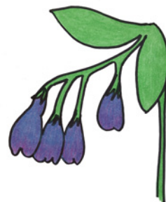
Tall Lungwort / Bluebells

Nice to look at, but not to eat. All parts are poisonous.