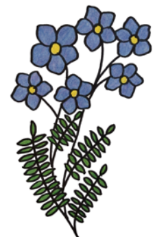
Showy Jacob's Ladder

Flowers range from pink to purple to blue.