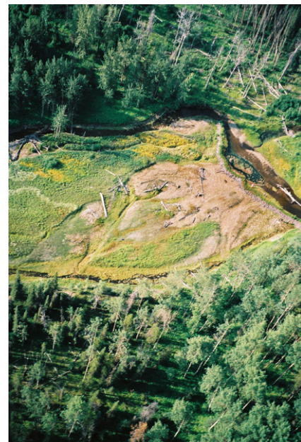
B. Bennett - YG