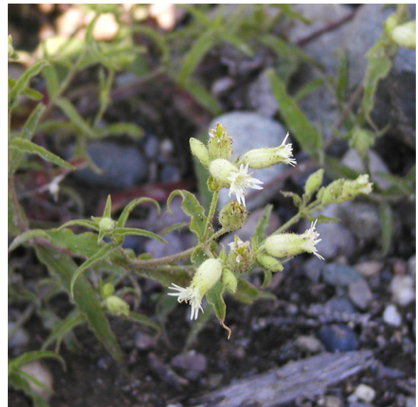
Alaska Natural Heritage Program