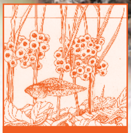
Eggs are laid in smal clumps 25 mm acros and attached to submerged plants.

When mating, male Boreal Chorus Frogs make a rising "kreeeep" similar to the sound of drawing your finger down a comb. They breed in the early spring, before the snow and ice have melted, and continue into June.