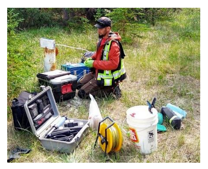
A groundwater technologist collects a groundwater sample from a YOWN well.

FOR MORE INFORMATION, PLEASE CONTACT: waterresources@yukon.ca