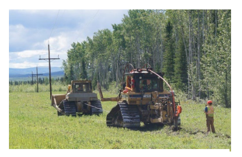
Conventional bury for areas with non-sensitive ground conditions. Generally involves two bulldozers cabled together.

This method is commonly used in fibre optic installations throughout the world and was used to install the line between Stewart Crossing and Dawson City. On this project, it is utilized in areas where the permafrost layer is at a depth greater than 1m, such as the Klondike Highway and the Southern sections of the Dempster Highway.