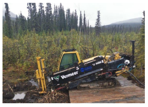
Horizontal directional drill and drill pad.

This unit drills a small diameter hole – measuring approximately 75mm – below the surface where the fibre conduit is placed.