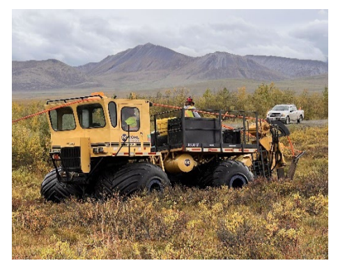
The Rolligon, pictured on the Dempster Highway in the Traditional Territory of Tr'ondëk Hwëch'in and the First Nation of Na-Cho Nyäk Dun.