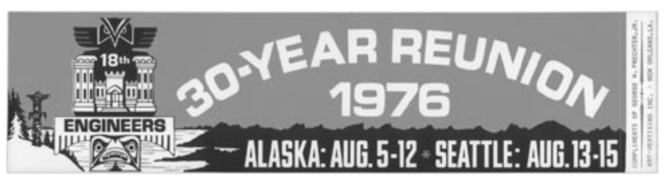
18th Engineers' 30-Year Reunion bumper sticker, 1976.

Alaska Highway and Canol Bibliography: page 109