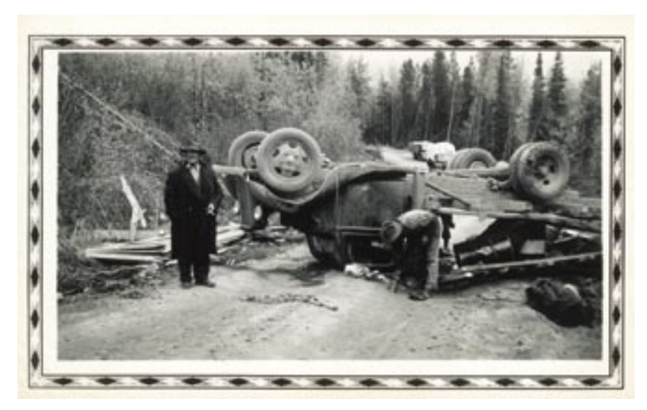
An accident on the Alaska Highway, 1943.