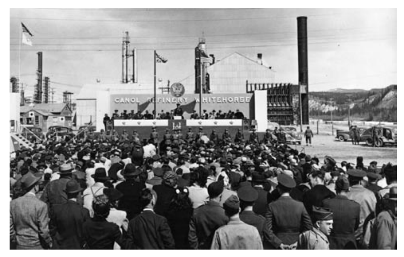
Dedication ceremonies for the Whitehorse Refinery, 1944.

806. Yukon Anniversaries Commission fonds. Rendezvous Road, Video V-213 (91/10), 1990. Note: Video designed to promote the 50th anniversary of the Alaska Highway.