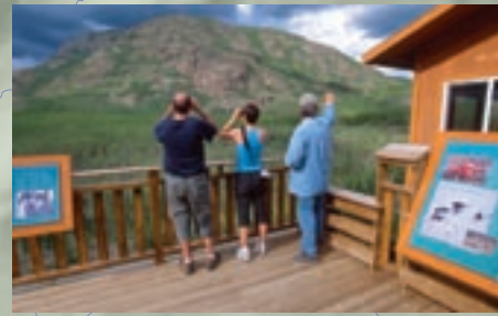
Mount Mye Sheep Centre

Moose Trail leads you up to the foot of Mt. Mye (6763). Pick your own route to explore this giant rock.