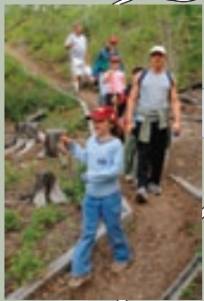
Family afternoon hike

Arboretum Trail Learn about local flora at the most northerly arboretum in Canada. The trail is steep but you will find benches and a viewing deck as well as interpretive signage along the way.