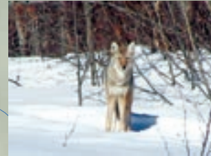
Coyote