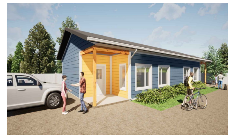
Mayo duplex, purpose built to be comfortable and accessible homes.